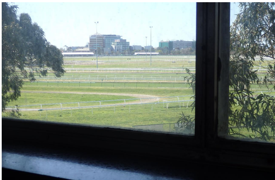
Figure 1. View of Caulfield Racecourse from second floor GEC classrooms