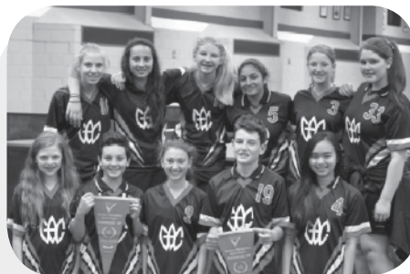
Year 7 & 8 Table Tennis Teams