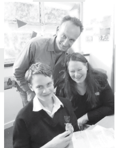
Year 7 French Immersion Show and Tell