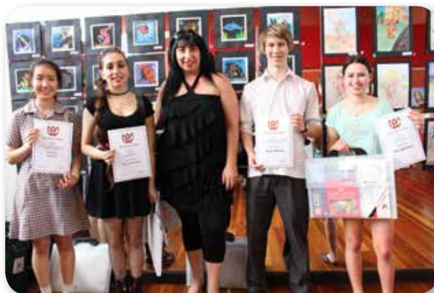
Arts & Technology Deans Art Winners