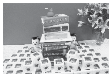
Year 12 Valedictory