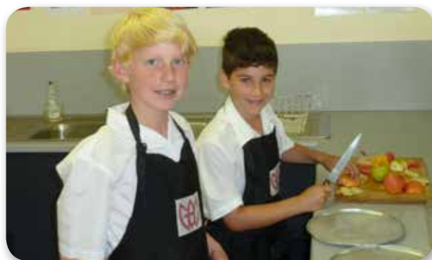
Year 8 Home Economics