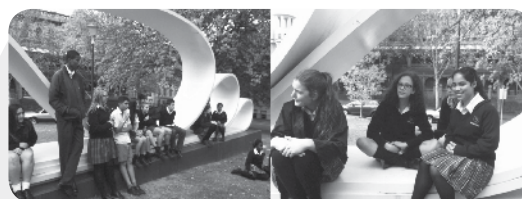
Year 10 Salvation Army Youth Homeless Tour

In week two of this term a small group of Year 10 students attended the Salvation Army Youth Homelessness Tour of the City, where they learned about the problems faced by young people who do not have a permanent and stable home.