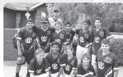
Year 7 Boys' Cricket