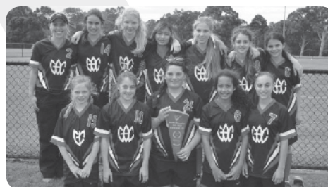
Year 7 Softball Zone Runners Up