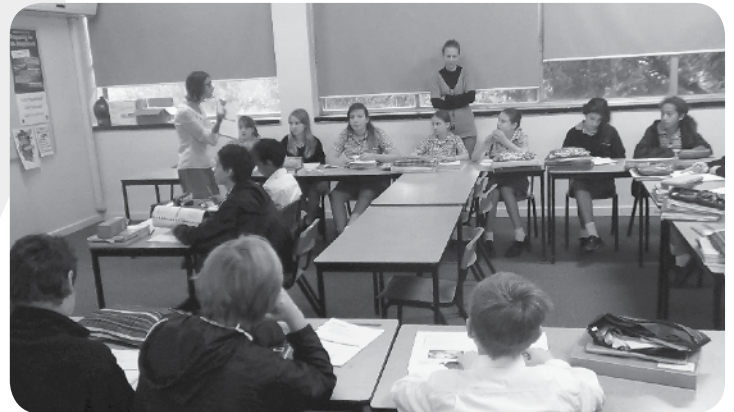
French Open Day