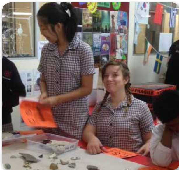
Year 7 Archaeology Incursion