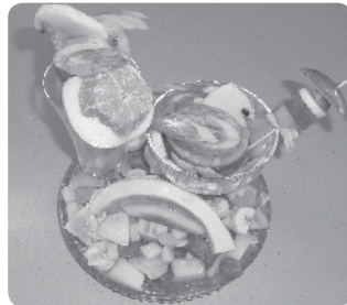
Year 8 Fruit Salad