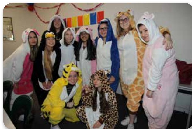
Year 12 Celebration Day