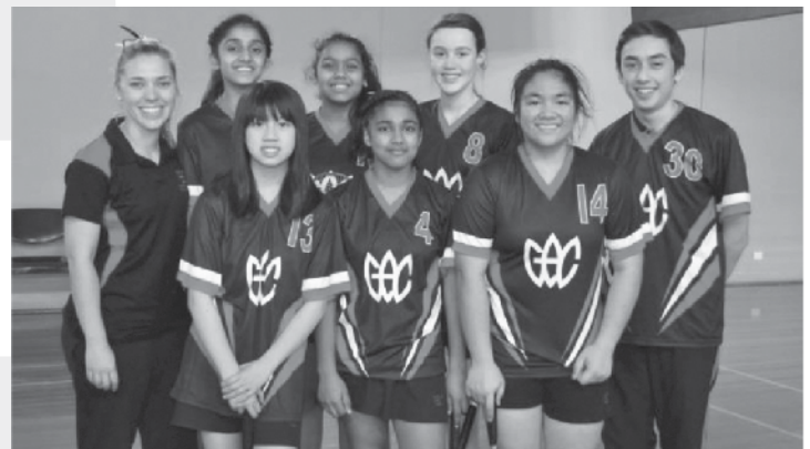
Year 7 Girls Badminton Team

After the Year 8 transition program our End of Year Program will run from 15th to 19th December. Students will be provided with a range of activities to be involved in during this time.