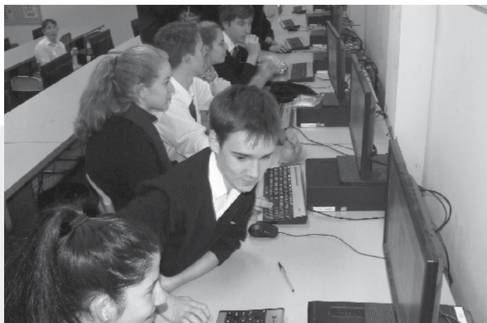
Year 10 IT interactive games session