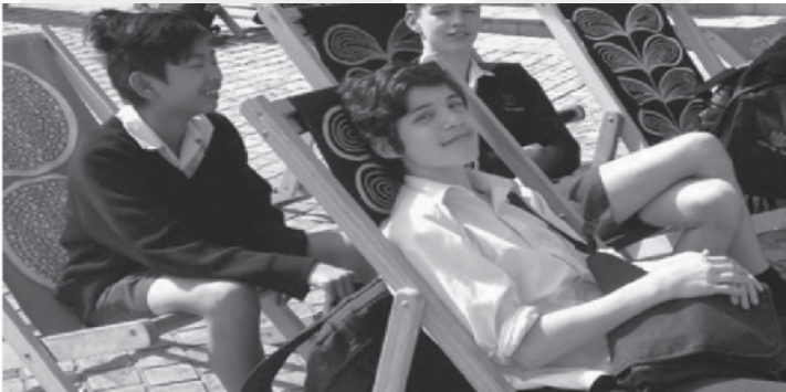
7F & 8F relaxing in Federation Square