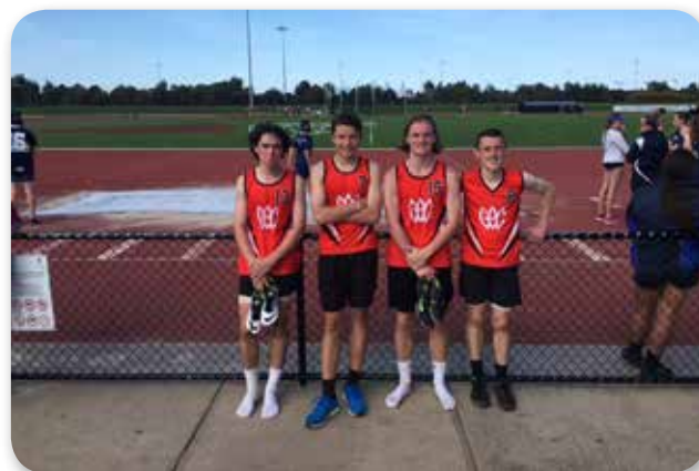
SMR Track & Field