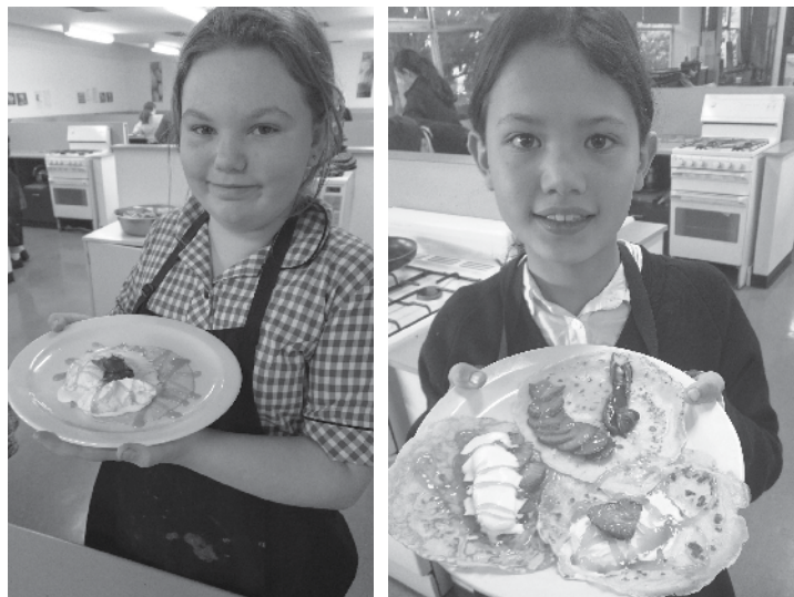
Food Technology Crepe Making & Decoration Competition