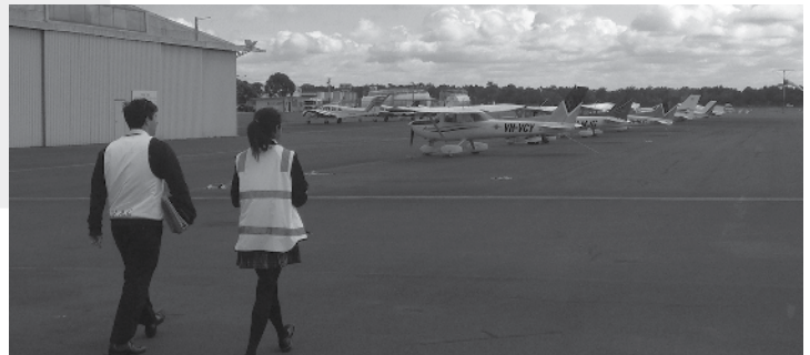
Year 11 Physics flight excursion