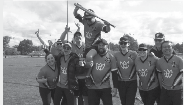
Teachers Games 2016 Softball Bronze Medal winning team