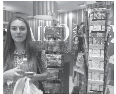
Shopping in DAISO