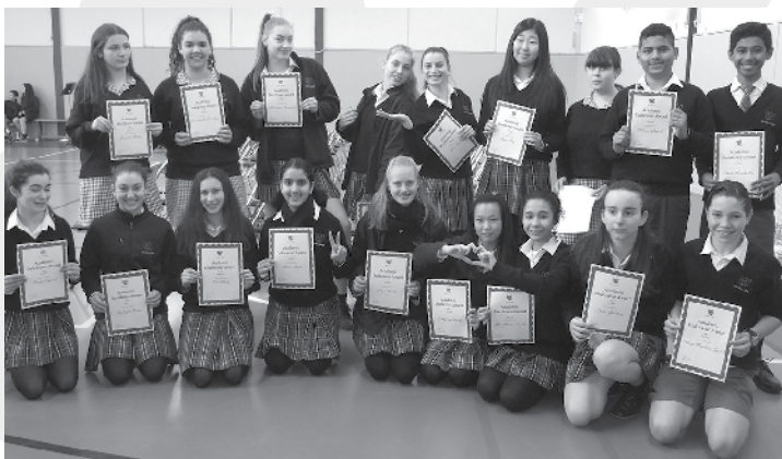
Junior School Mid-Year Awards Assembly