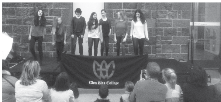
Bastille Day Festival