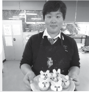
Year 9C Cupcake designs