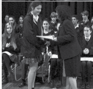
Senior School Mid-Year Awards Assembly