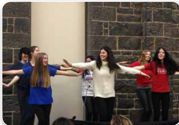
Bastille Day Festival