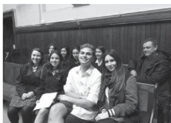
Legal Studies class