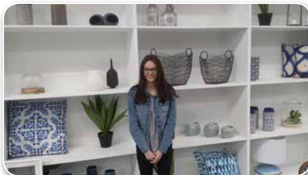
Year 10 Work Experience