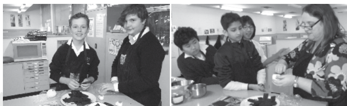
Year 7F & 8F making onigiri