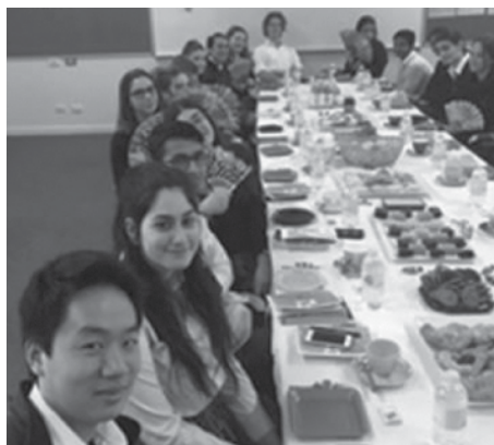
Year 11 The Importance of Being Earnest Tea Party