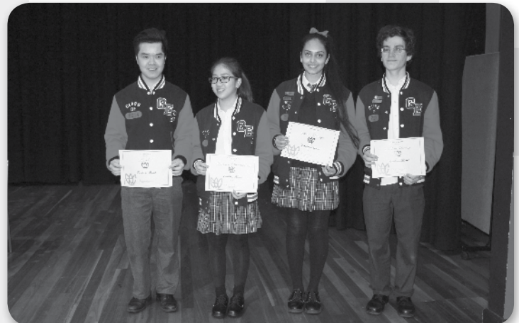
Year 12 Mid Year Award Recipients