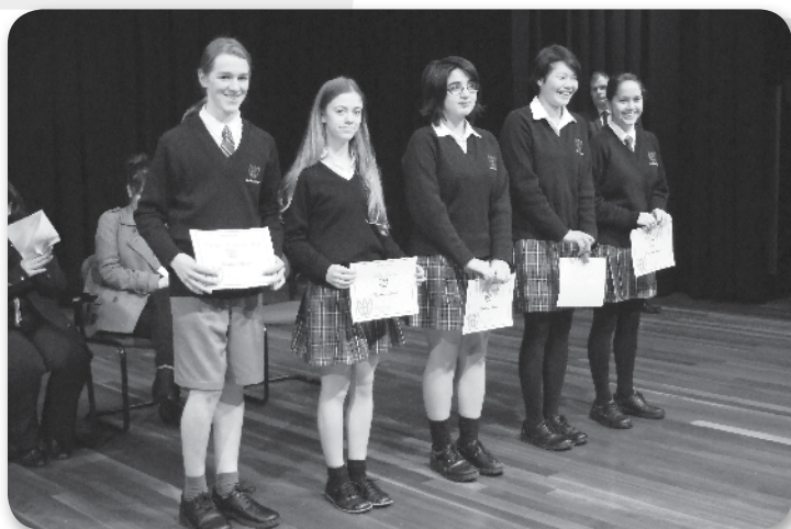
Year 11 Mid Year Award Recipients

In light of the semester one reports, it is quite timely that I am currently organising study skills workshops for all year 11 students in the coming weeks. The workshops are delivered by top performing VCE graduates who discuss and demonstrate the importance of goal setting and give clear study skills strategies for success in the VCE.