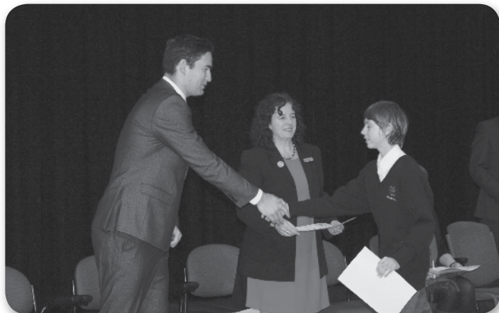
Junior School Mid Year Awards Assembly