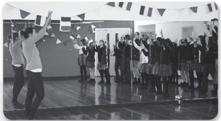
Celebrating Bastille Day at GEC