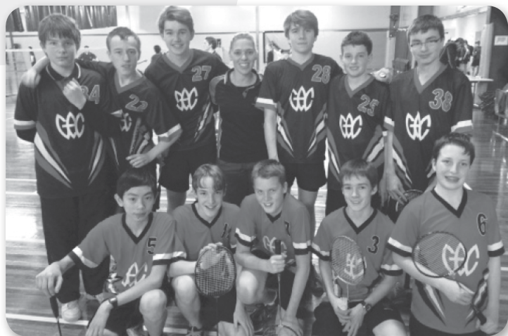
Year 8 Badminton Team