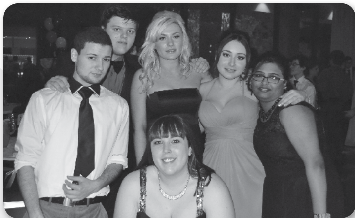
Year 12 Formal