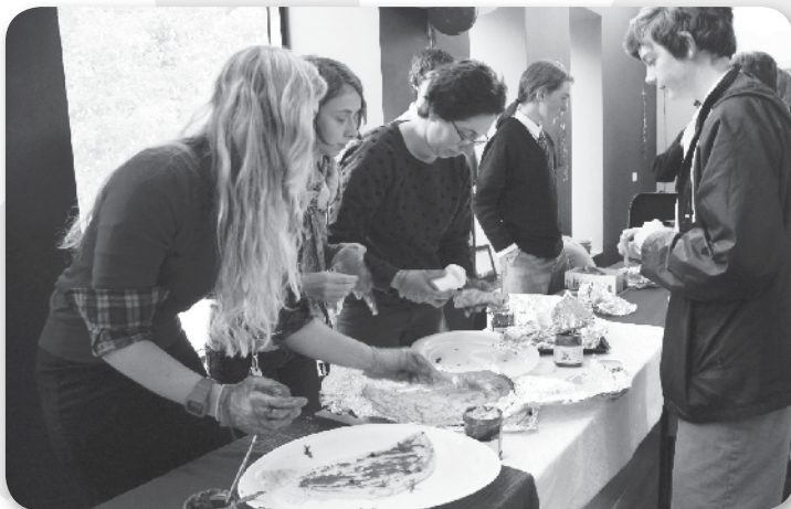
Celebrating Bastille Day at GEC