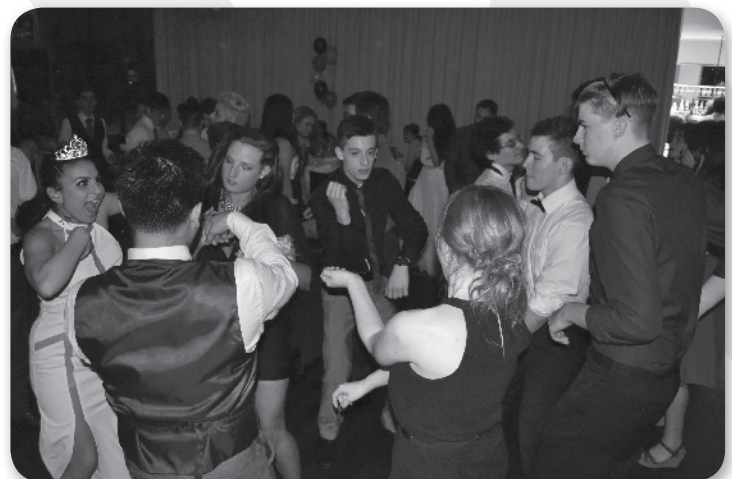
Year 12 Formal