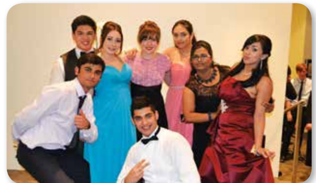
Year 12 Formal