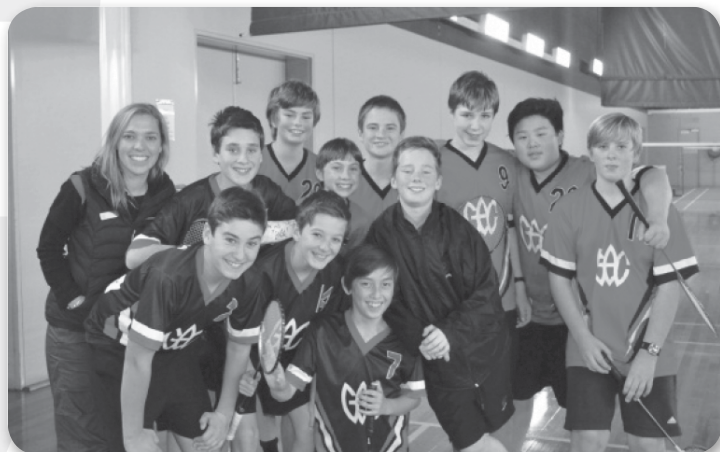
Year 7 Badminton Team