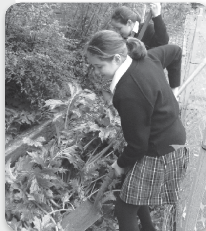
GEC Sustainability Club in action