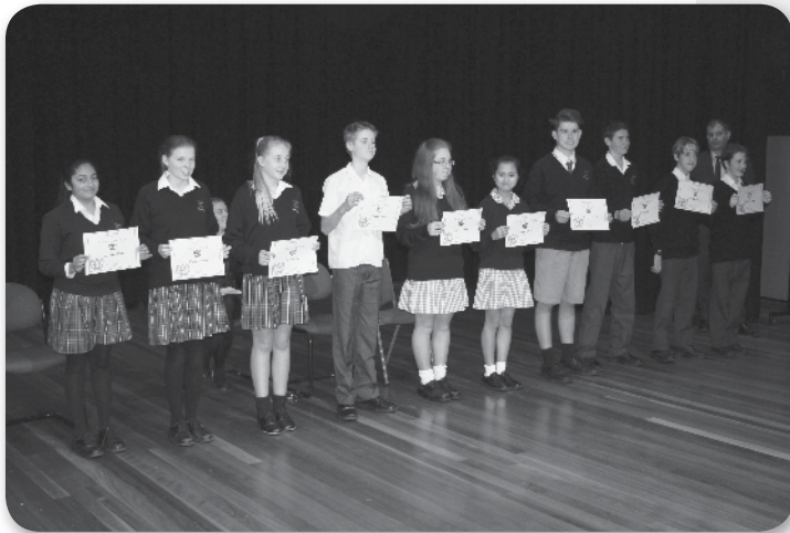
Year 8 Mid Year Award Recipients