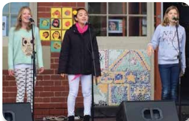
Singers at Carnegie Primary