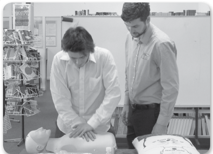
Senior Health & Wellbeing Expo

Have you recently changed, or are about to change, address or home, mobile or work phone number? Please remember to ring the College on 9571 7838 to keep us informed.