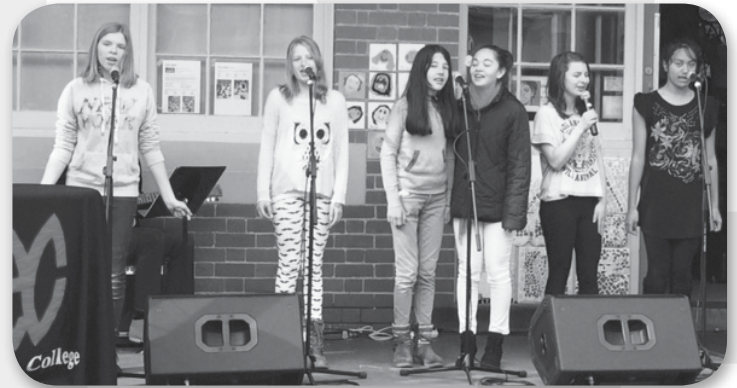
Singers at Carnegie Primary Fete