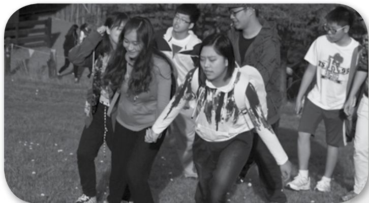
English Language Centre Camp

Many students commented that this was their first camp experience and were excited as they faced new challenges such as the Flying Fox, High Ropes, Archery, Hut Building and other activities. On the second day students worked in teams to prepare a concert showcasing their diverse talents and cultures.