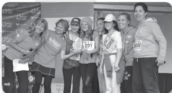
Largest School Team Winners