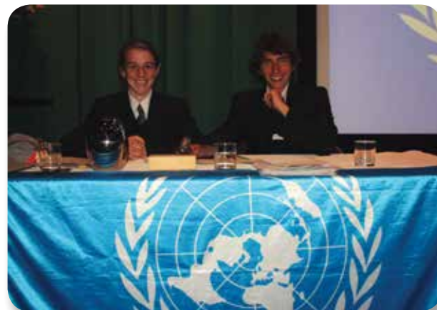
French Model United Nations