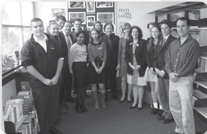
CNED Representatives at GEC