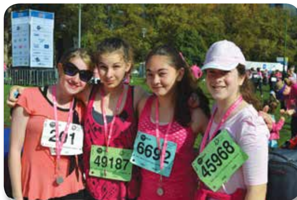
Mother's Day Classic