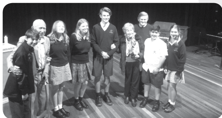
Junior School students with our special guests at the Holocaust Remembrance Assembly