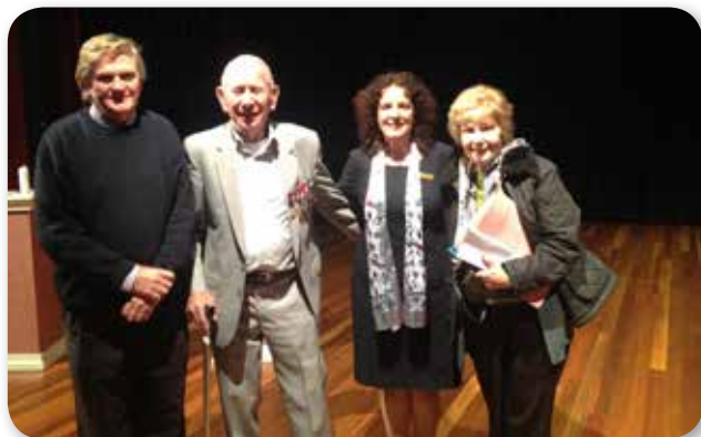
Yom HaShoah Assembly