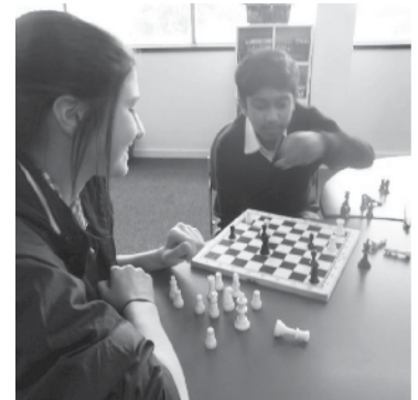
Chess Club participants