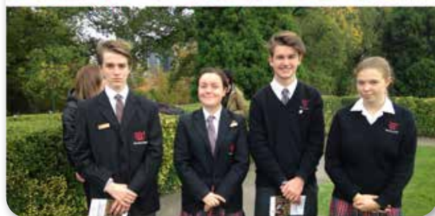
ANZAC Day Commemorations