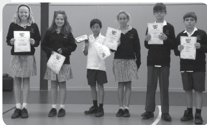
Great Community Art Mashup winners

All Year 7 Glen Eira art students participated in "The Great Community Art Mashup" as part of the Glenhenty Village Street Festival.