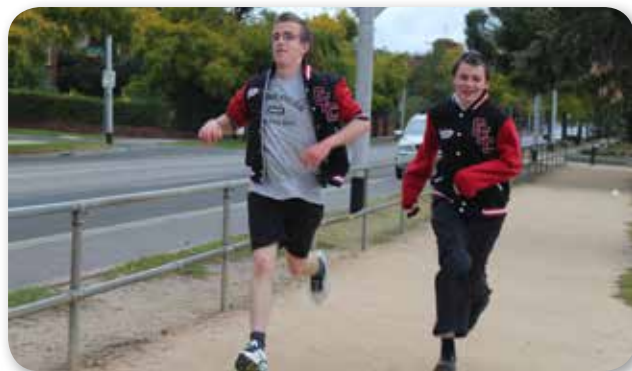
GEC Cross Country