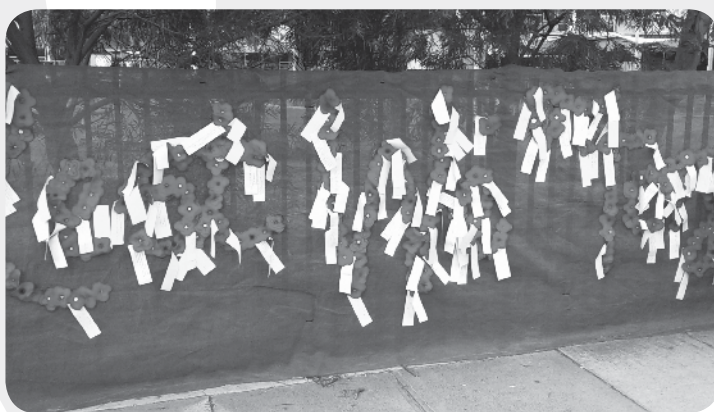
ANZAC Day Commemorations

We started the week with students making poppies with a message of thanks to an ANZAC of their choosing which was added to a banner at the front of the college. Our Language Centre students created a field of poppies reminiscent of Flanders Fields. This began students on a journey of growth and contemplation about the importance of commemoration and what is truly meant by the 'ANZAC Spirit'. In class many students wrote poems, studied the history of Gallipoli and were able to see firsthand reproductions of WW2 artefacts and write a historical reimagining of an ANZAC experience.