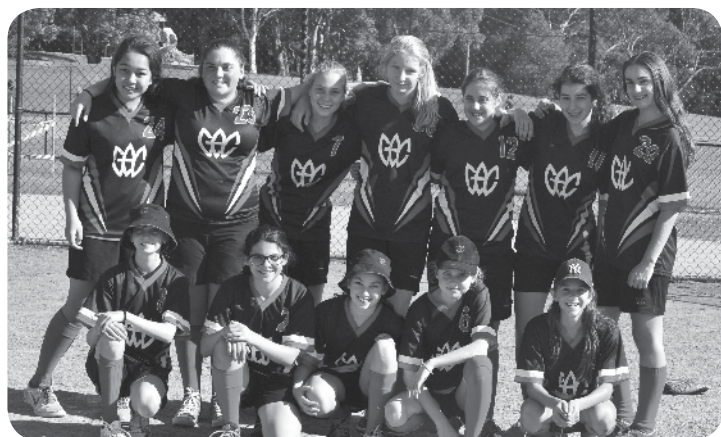
Year 8 Girls' Softball Team