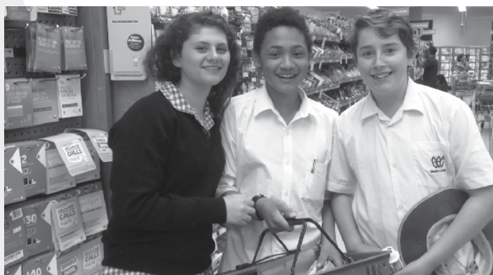
Year 9 Hebrew Supermarket Excursion