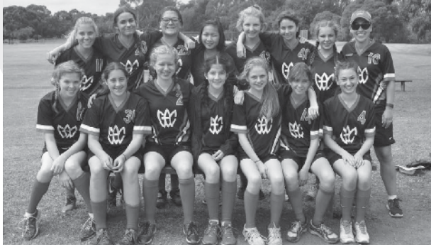
Intermediate Girls' Softball Team