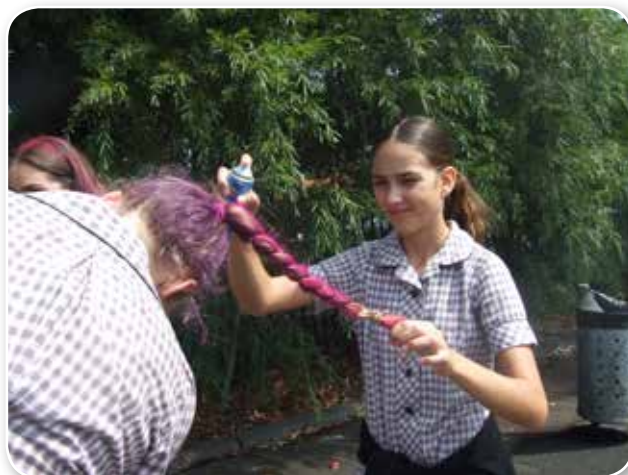
Funky Hair Day