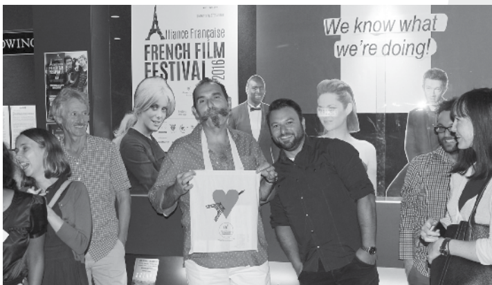
Staff French Film Festival evening