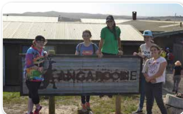
Year 8 Camp