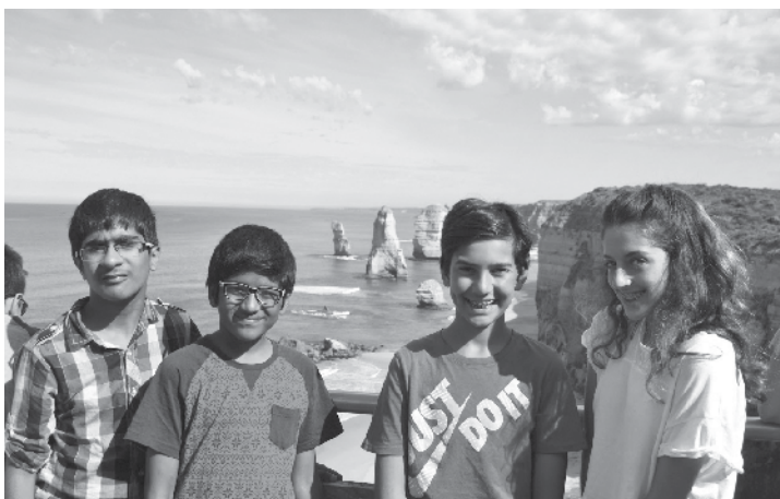
Year 8 Camp