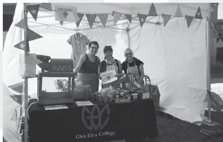
GEC Parents Association's stall at the Party in the Park

How many snow cones did the Glen Eira College Parents Association sell at the busy Party in the Park in Princes Park? With handmade notebooks made by us from spare pages of students exercise rise books, homemade jam and honey, we made $1,400 for Glen Eira College. A warm sunny day with a big crowd meant brisk sales and a chance to raise the schools profile in our local community and chat to prospective parents about the school. Thanks to everyone who worked so hard before and during the event. It was a real team effort.