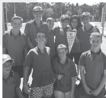
Beachside Swimming Competition