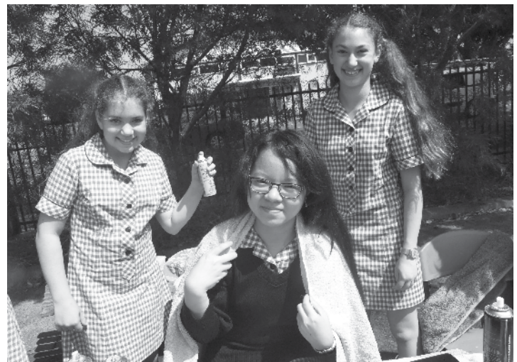
Funky Hair Day