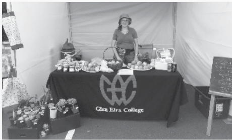
Glen Huntly Village Festival Stall

If you are not already receiving our emails please ask us to add you to our list by sending an email to gecpa@gec.vic.edu.au