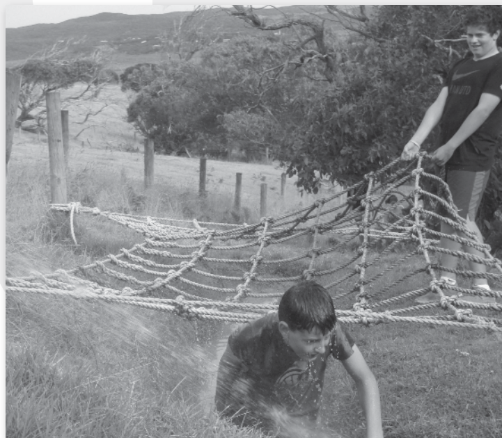
Year 8 Camp