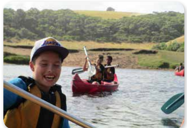
Year 8 camp