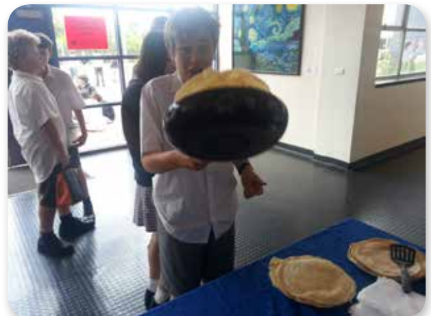
Crepe flipping for Francophonie Week