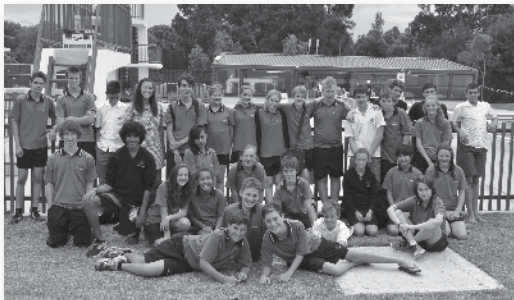
Division Swimming Squad