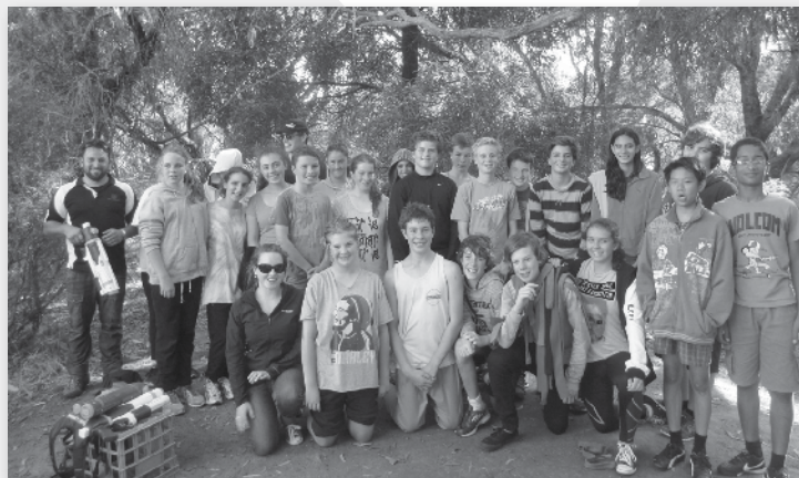
Year 8 Camp