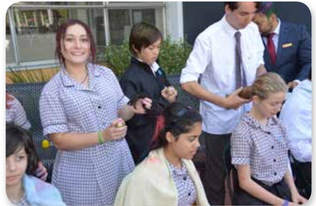
Funky Hair Day