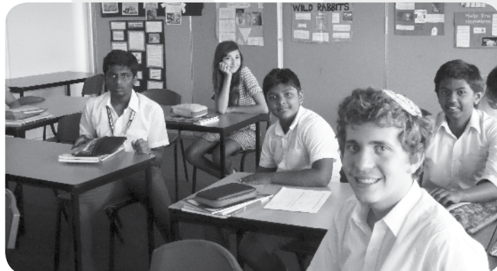
Year 9 students settling in to 2015