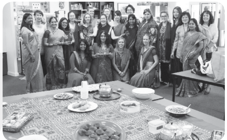
Students and Staff celebrating the Festival of Lights