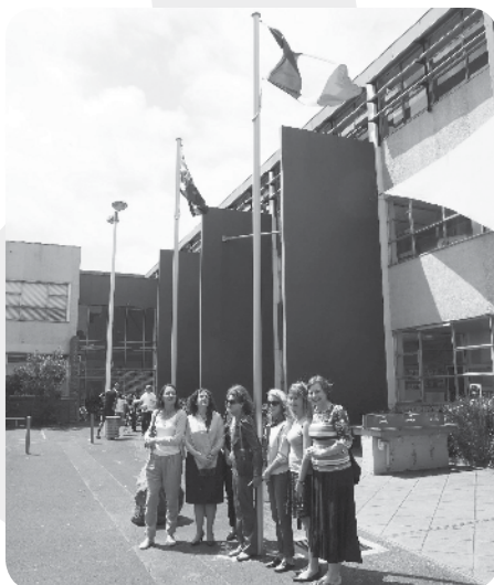
Members of our wonderful French Community