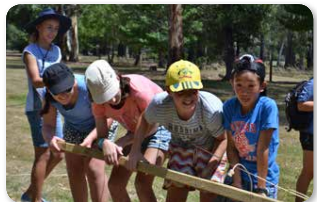
Year 7 Camp