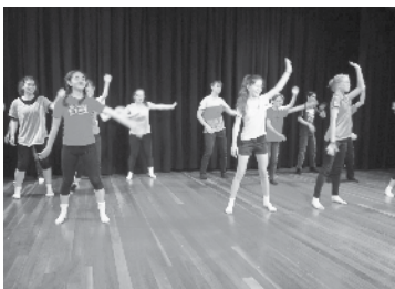
Students performing at the Languages Assembly