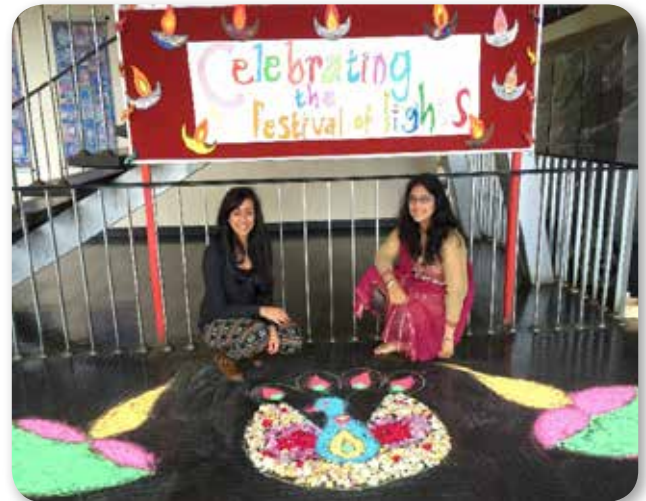
Diwali at GEC