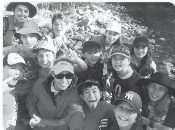
Year 7 Camp