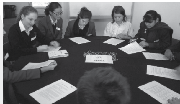
Gifted & Talented Student Conference