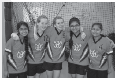
Year 8 Girls' Badminton