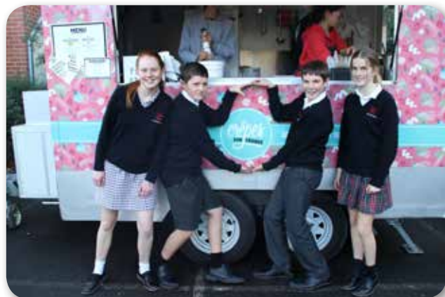
Crepes for Change