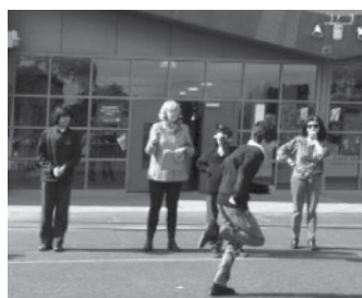
Going For Gold at GEC