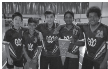
Year 7 Boys' Badminton