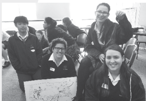
Year 11 Fit2Drive Program