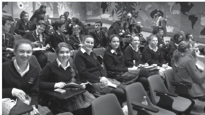
D.A.V. Junior Public Speaking Competition