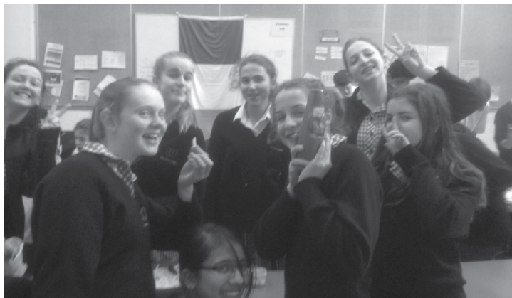
Ze French Club