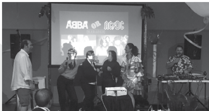
Trivia Night – GEC Goes to Rio