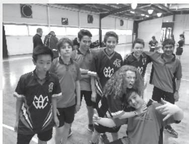
Year 8 Boys' Futsal