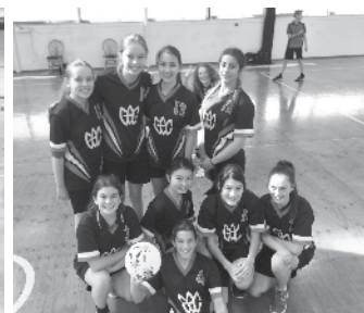
Year 8 Girls' Futsal