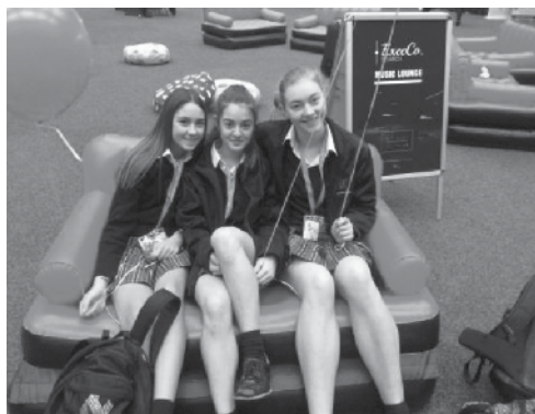
Year 9 Go Girls, Go For IT Excursion