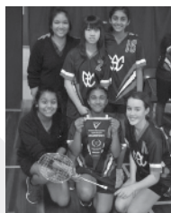
Year 7 Girls' Badminton