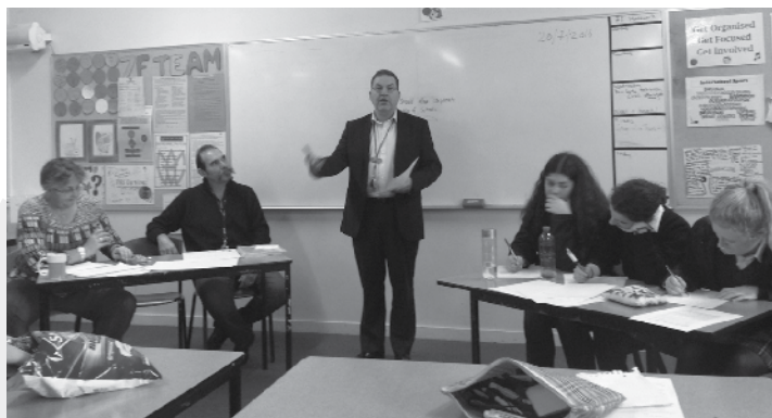
Teachers and Year 10 practice debate